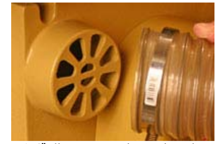
A 4"-diameter port is cast into the lower housing directly below the blade for super-effective dust evacuation.

Rather than routing dust down through the base cabinet we form a port for a 4"-diameter dust hose in the lower cast iron section of the POWERMATIC PWBS-14 Bandsaw. Placing the port where the dust is created greatly improves its effectiveness and eliminates the leaks found in through-the-ca